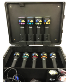
Battery Charger Cradles in the Carry case.

The beam is collimated with a 2-25° half angle divergence giving a superbly even light spot. In addition, a range of beam profile filters are available which can be clipped onto the front of the Flare® Plus2 head to create a wider divergence or a strip of light ideal for shoeprint visualisation. If you used the Polilight-Flare® Plus for 8 hours per day, 5 days per week, the LED light source would still be working after 25 years !