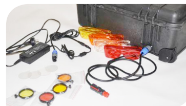
Accessories – Goggles, Car Charger and AC Charger